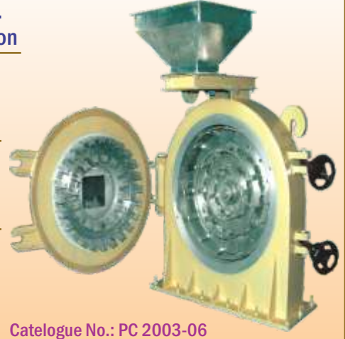
Catalogue No.: PC 2003-06