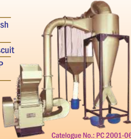
Catalogue No.: PC 2001-06