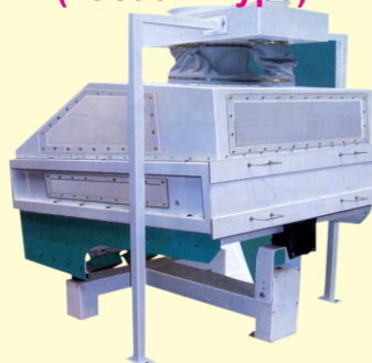
DESTONER (Vacuum Type)