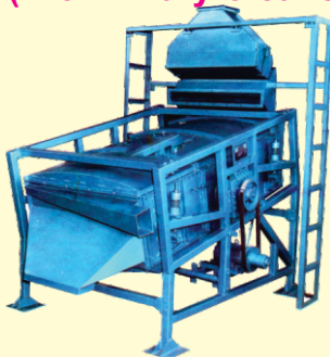
SCREEN AIR SEPARATOR (Preliminary Cleaner)