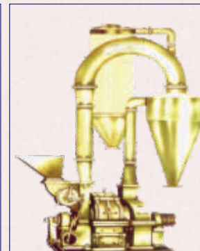
IMPACT PULVERISER (IMPEX PULVERISER)