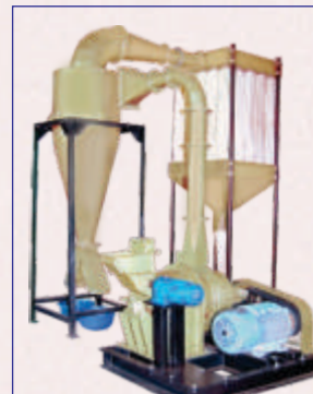
WIZZCON MILL (AIR SWEEPED MILL)