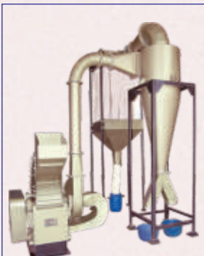
MIRACLE MILL (STAR HAMMER MILL)