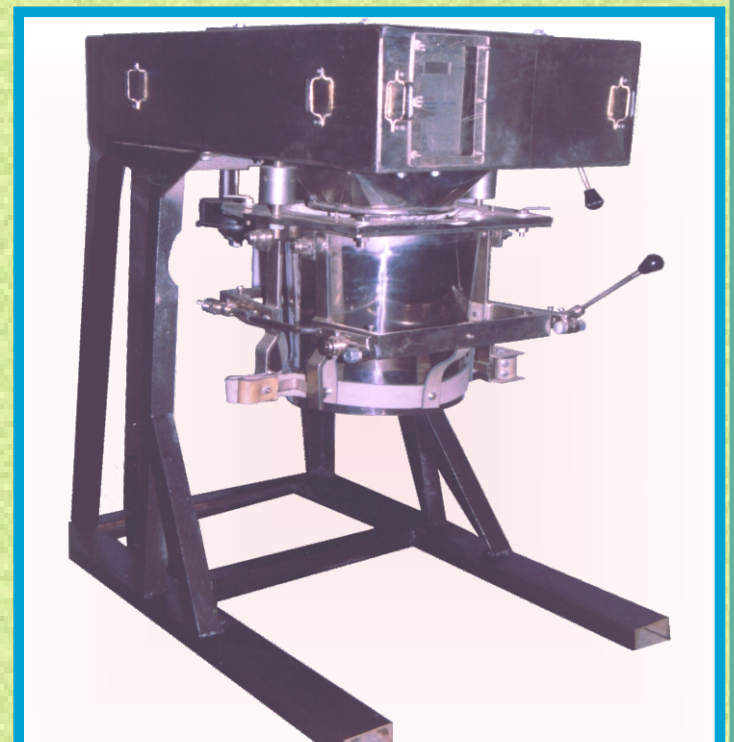
MODEL: PBW-MS/AS-SS (Stainless Steel)